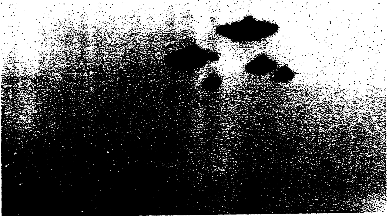
Sheffield, England, 4 March 1962